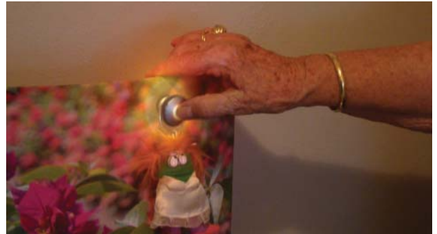
Figure 5: Explicit actions of both users