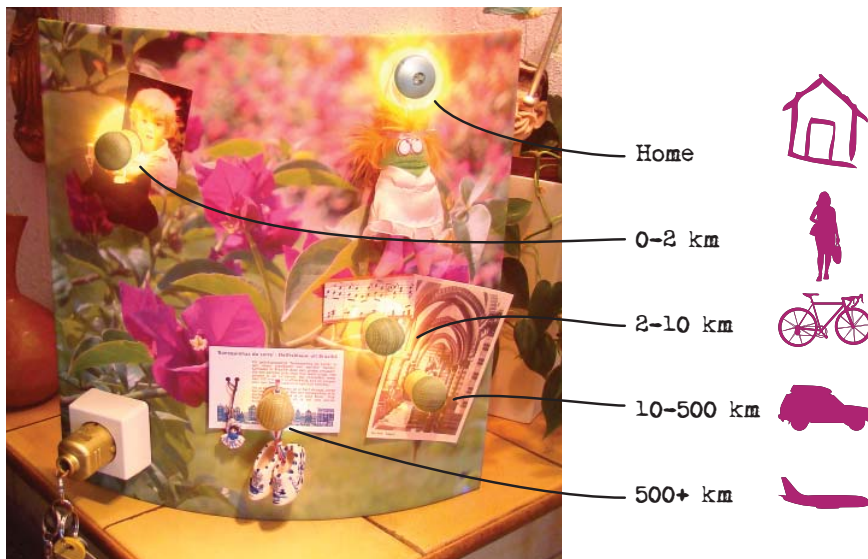
Figure 6: The intensity of the projected light shows the distance from a contact to his/her board.

The KeyPing is a precious addition to current communication systems, without being incriminating or obtrusive for its users. In a delicate and simple way, the KeyPing makes elderly feel more connected with their social neighborhood.