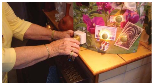
Figure 2: A special KeyRing to activate the KeyPing board