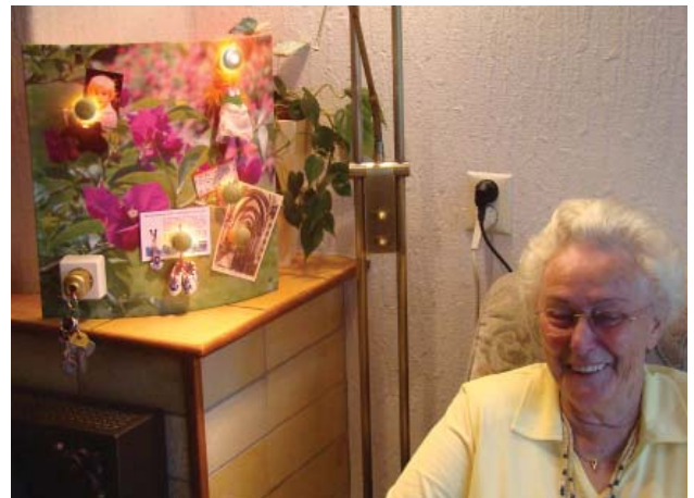
Figure 1: A KeyPing board

By changing the background of the KeyPing board, the system fits in every home. The personal configuration of the ThinKeys on the board enables users to expand, control, and (re)arrange their network at any favorable moment.