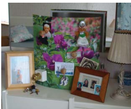
Figure 4: The KeyPing board on different places