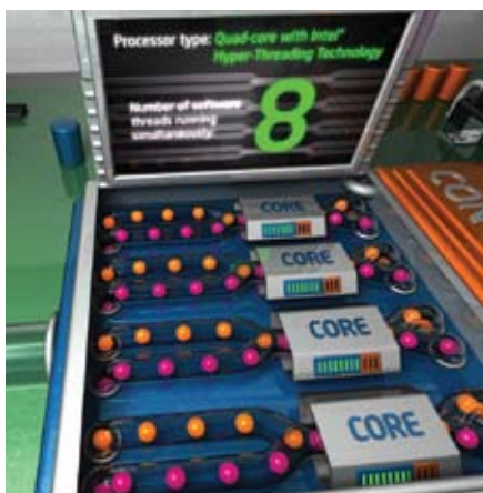
Hyper-threading makes a return appearance, accelerating applications by handling up to eight threads on four cores.

Colin Smith, Senior Solutions Architect, Adobe