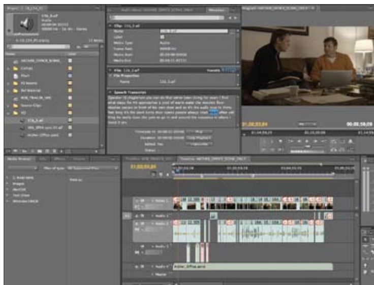
The Adobe Speech Search feature in Premiere Pro CS4 provides a quick means to transcribe voice tracks and locate specific words and passages.

Field work often requires tools that support digital media creation in extreme or difficult situations. Developed to support direct-to-disk video monitoring and production, Adobe OnLocation CS4, included with Adobe Premiere Pro CS4, provides features for monitoring and capturing footage on a laptop while in the field. This footage can then be quickly dropped into Adobe Premiere Pro for further editing. As an added benefit, when capturing from tapeless cameras, Adobe Premiere Pro offers the convenient Media Browser to give you quick access to your hard drives, cards, camera, and other storage media from within Adobe Premiere Pro. While in the field, moviemakers can begin editing directly from a camera’s removable storage media. Continuity