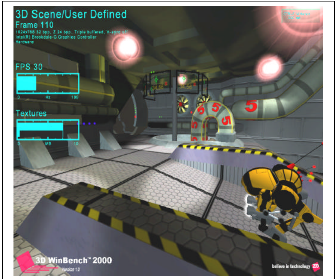
Figure 3: 3D WinBench* 2000 Scene with Average Depth Complexity of 2.72

this scene with a conventional 3D graphics pipeline is 2.72 times more than with a Zone Rendering 3D graphics pipeline.